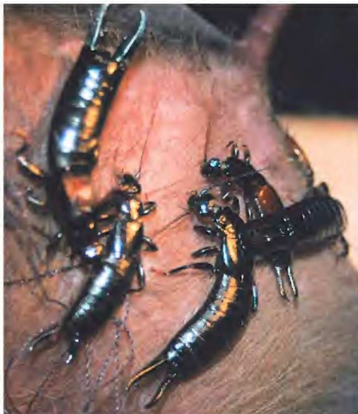
Figure 2. The dorsal rump of a female Eonycteris major (TTU 108410) with a colony of earwigs (Order: Dermaptera: Chelisochidae; Scizochelisoche sp.). The tail of the bat is visible in the upper right quadrant of the photo.